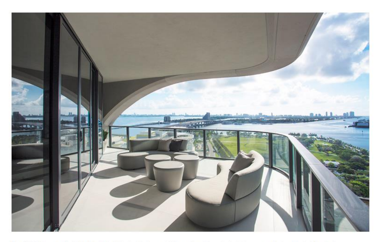
The 1000 Museum by Zaha Hadid Architects is just one of the residential projects to have recently risen up in Miami, where a residential real estate boom is sweeping through the city.

ARCHITECTURE / 20 DEC 2017 / BY DAVEN WU