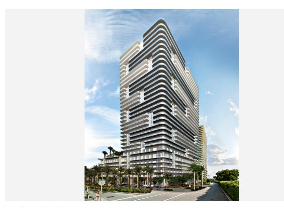
Hyde Midtown Suites & Residences

On Brickell's buzzy east side of Brickell, the willowy silhouette of Echo Brickell is the work of architect Carlos Ott and YOO Studio. Set to open in autumn 2018, its 180 residences are paired with bracing views of Biscayne Bay, South Beach and Downtown Miami.