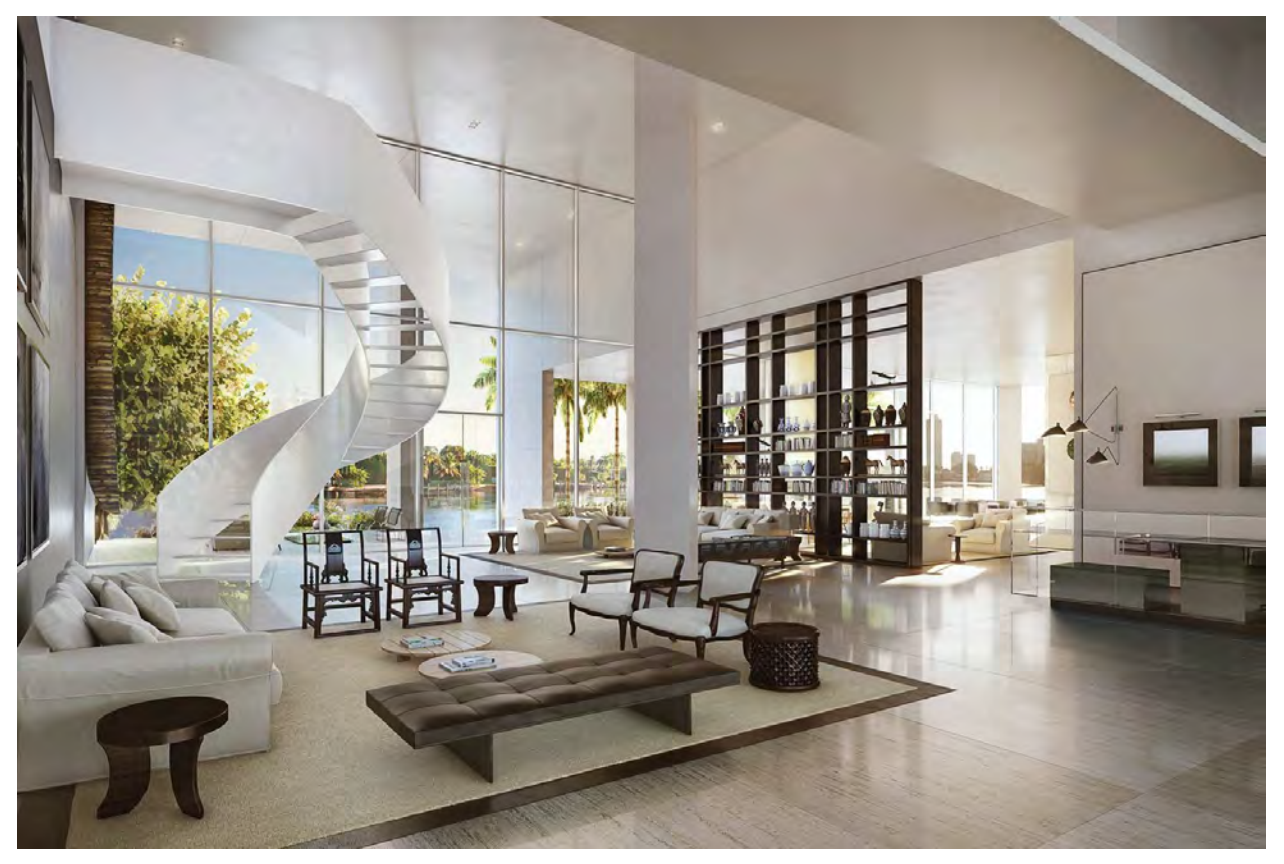
The Ritz-Carlton Residences Miami Beach by Piero Lissoni