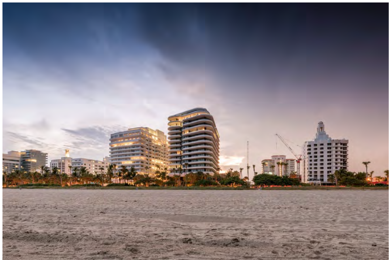
Faena House Miami Beach by Foster + Partners