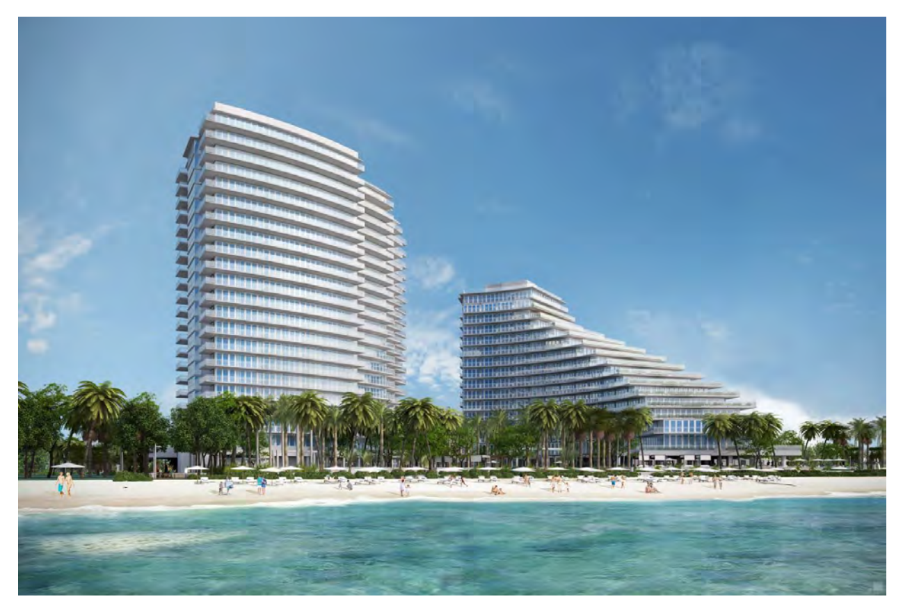
Auberge Beach Residences & Spa by Nichols Brosch Wurst Wolfe & Associates