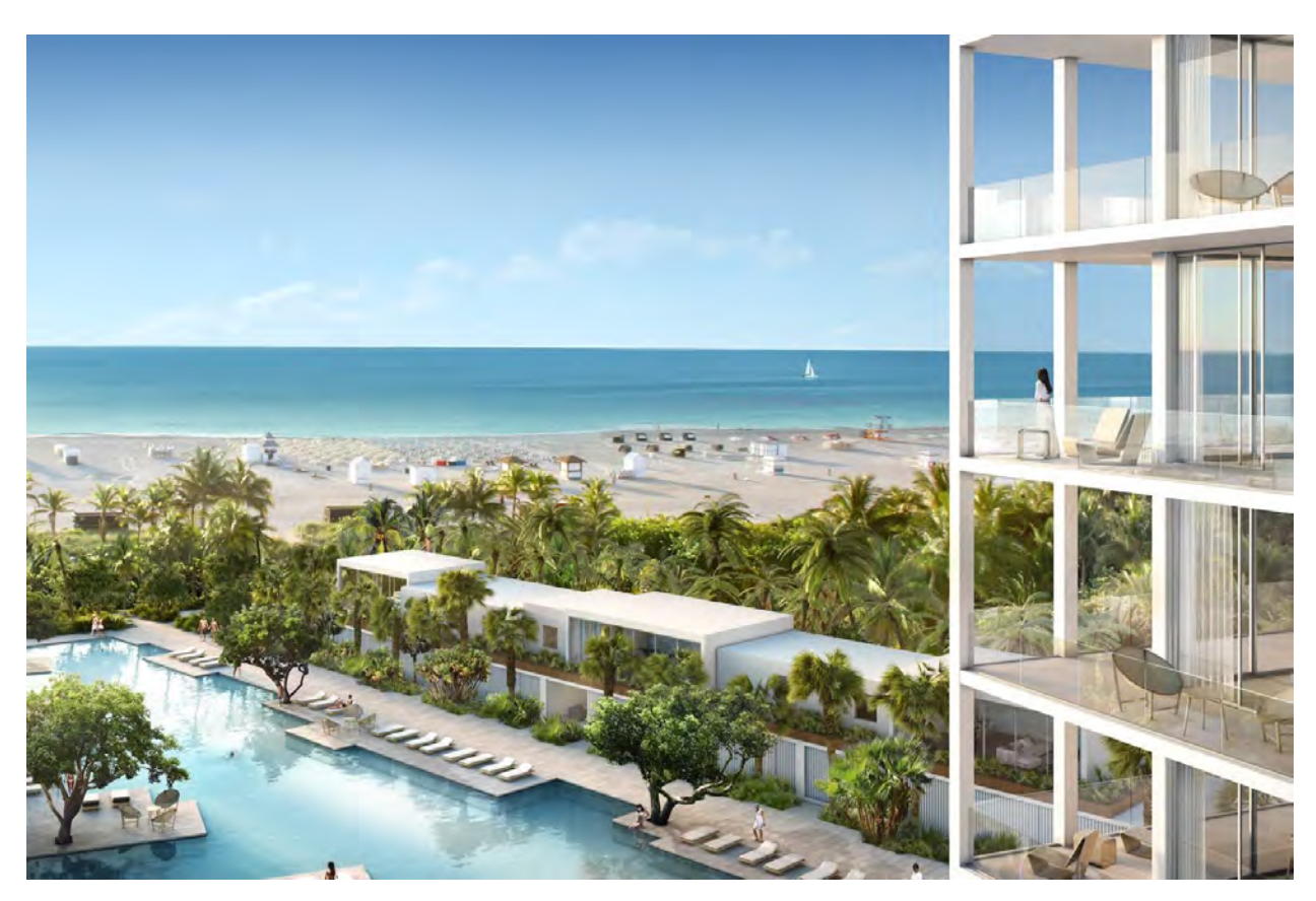
Fasano Hotel & Residences Miami Beach by Isay Weinfield