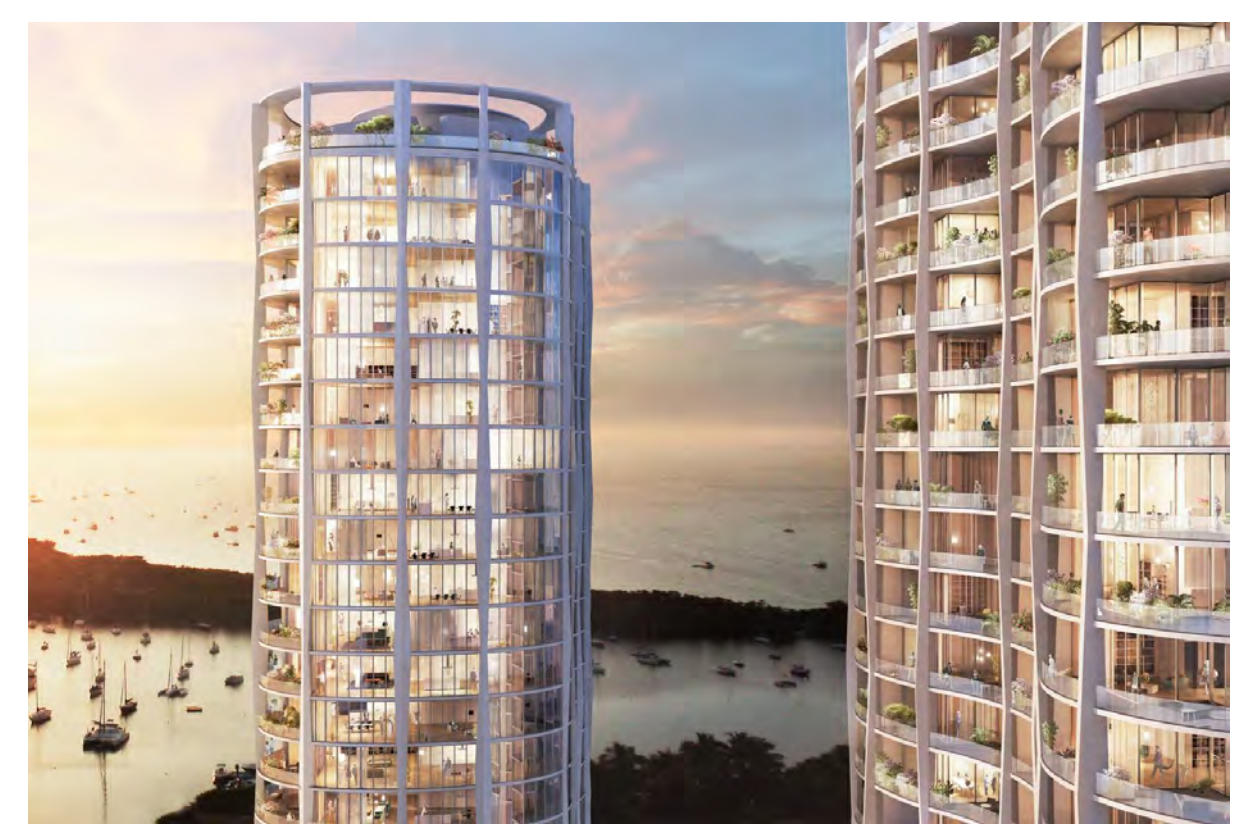
Park Grove by OMA/Rem Koolhaas