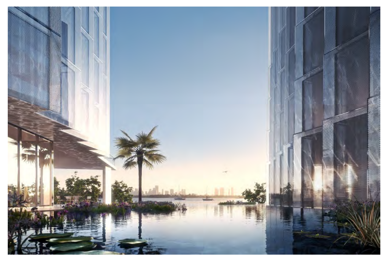
Monad Terrace by Jean Nouvel