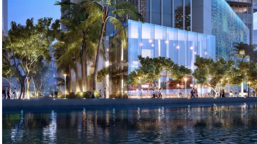
One River Point. Credit: Rafael Viñoly Architects.