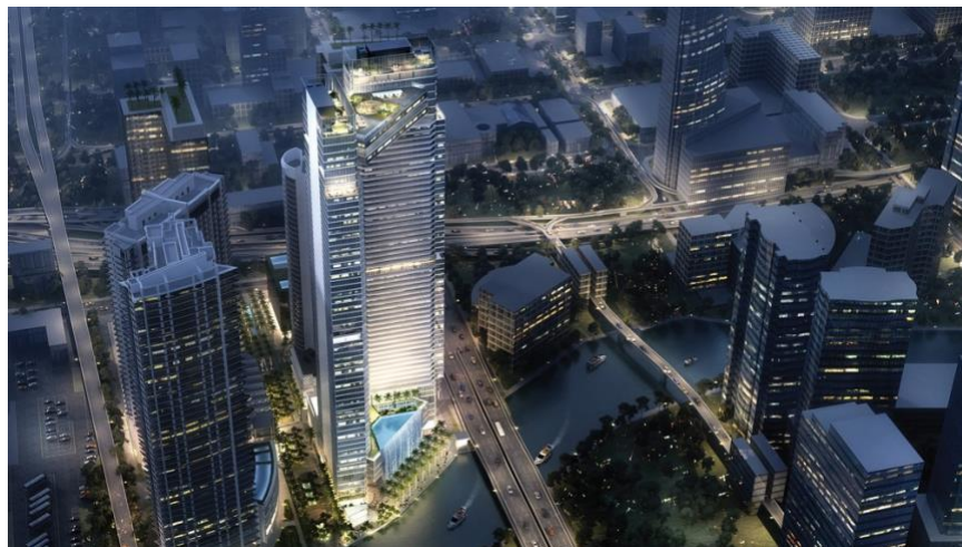
One River Point. Credit: Rafael Viñoly Architects.

Defortuna cited his past success with Karmely and the unique prospect of co-developing a waterfront site in one of Miami’s prime neighborhoods as a rare opportunity and the driving force behind the decision. The fully approved One River Point project, designed by the star architect Rafael Viñoly of Rafael Viñoly Architects , is currently being adapted to today’s market and lifestyles. The developers are putting together the final touches on the personality and lifestyle components of the property and plan to take it to the market in 2023.