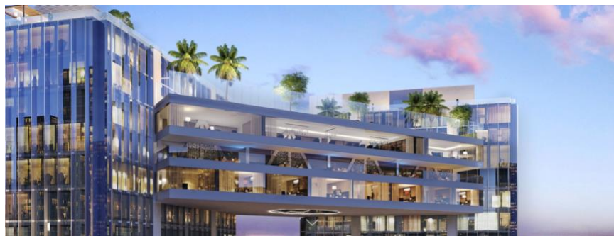
One River Point.

The Uruguayan architect and founding principal of Rafael Viñoly Architects has a diverse portfolio of award-winning projects spanning the globe, from museums and performing arts centers to hotel and residential complexes; throughout his 45 years of architectural practice, Rafael Viñoly is credited for his design originality in landmark projects and inspiring architecture. His achievements include New York's 432 Park, The Cleveland Museum of Art, the Tokyo International Forum, and Battersea Power York's, effectively transforming riverfront living in London's heart. One River Point is internationally-acclaimed Rafael Viñoly's first residential prLondon's Miami.